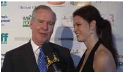
Walk the red carpet of the Gasparilla International Film Festival with Mayor Buckhorn.

Watch episodes of "Ybor Flavors" on Bright House channel 615 or Verizon channel 15 or online at YborCityOnline.com .