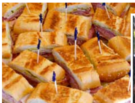
Ybor City cigar workers ate what was originally called the mixto. The mixto was transformed into the Cuban sandwich when the Sicilians added Genoa salami.